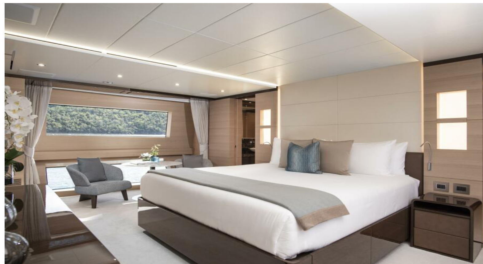
On Deck Owner Suite Forward