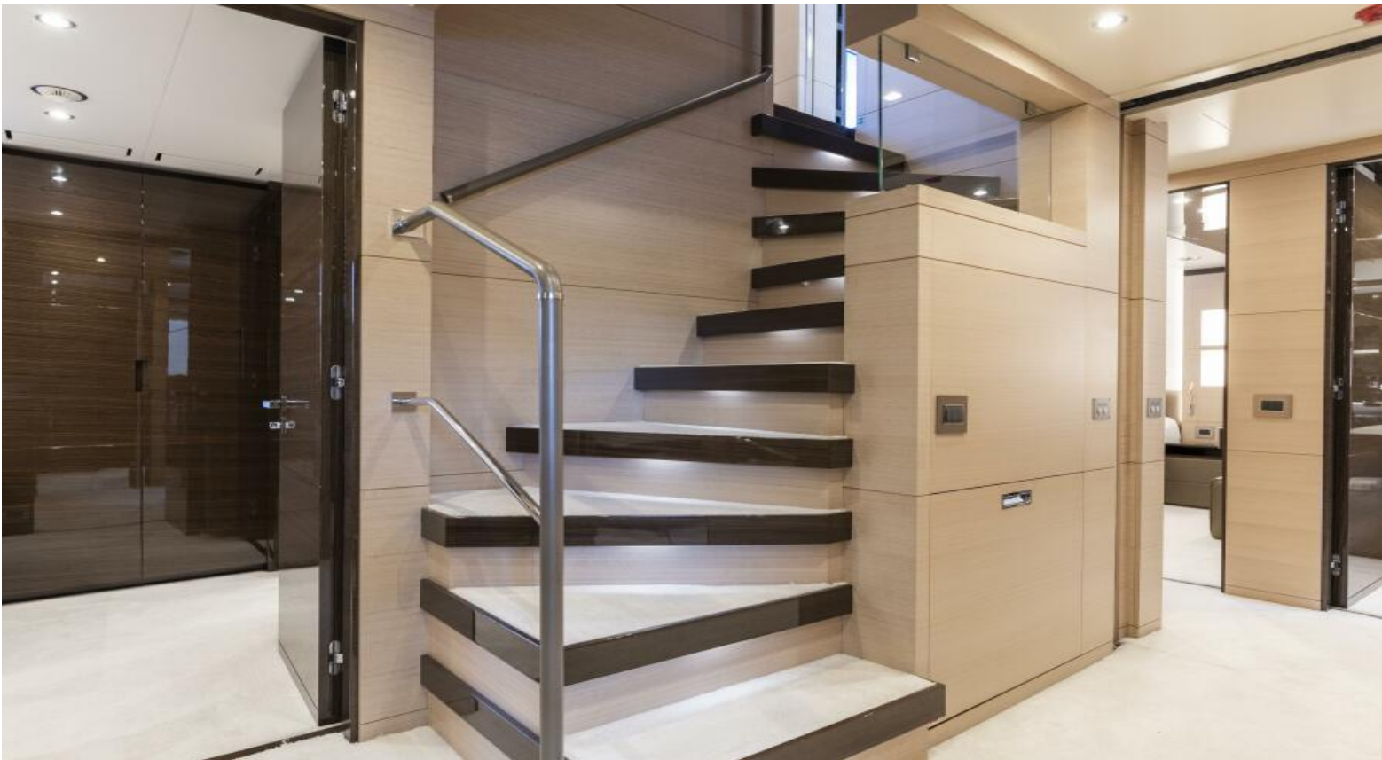
Stairwell To Lower Guest Lobby