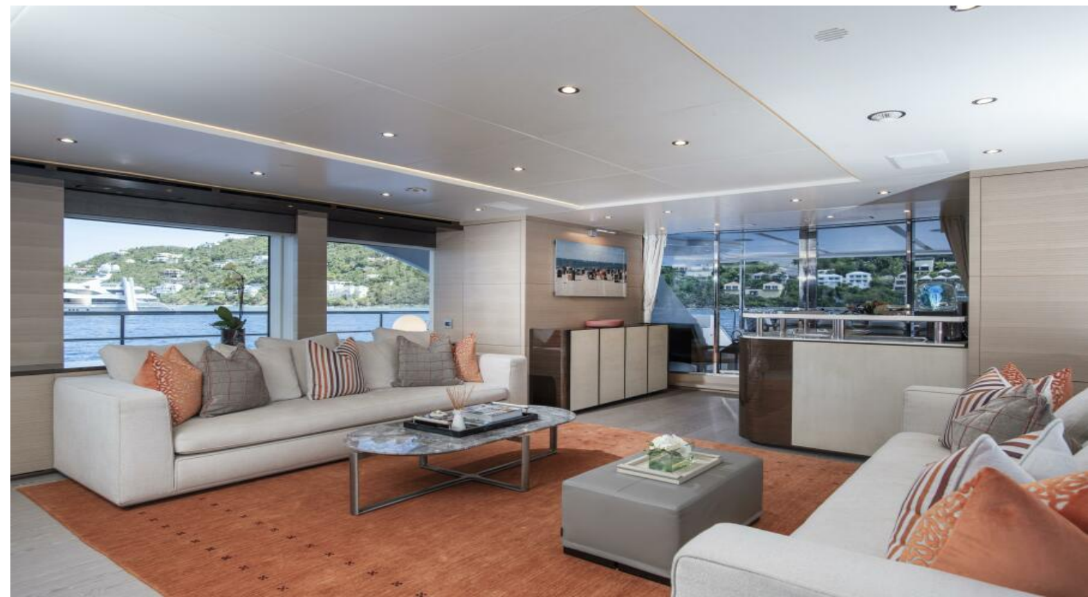
Salon Facing Port