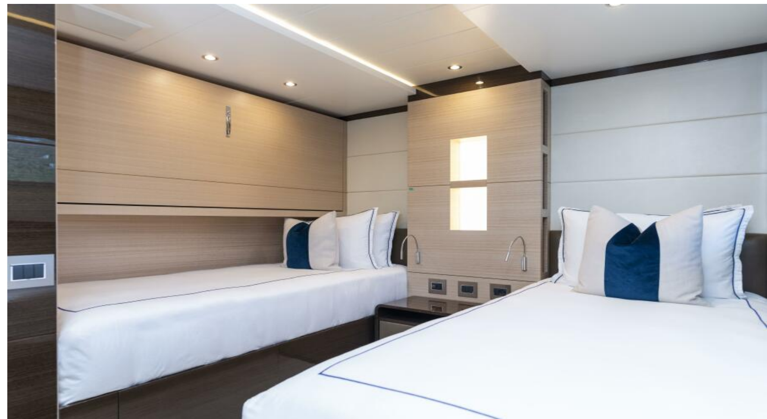
Lower Deck Twin Cabin With Pullman Berth