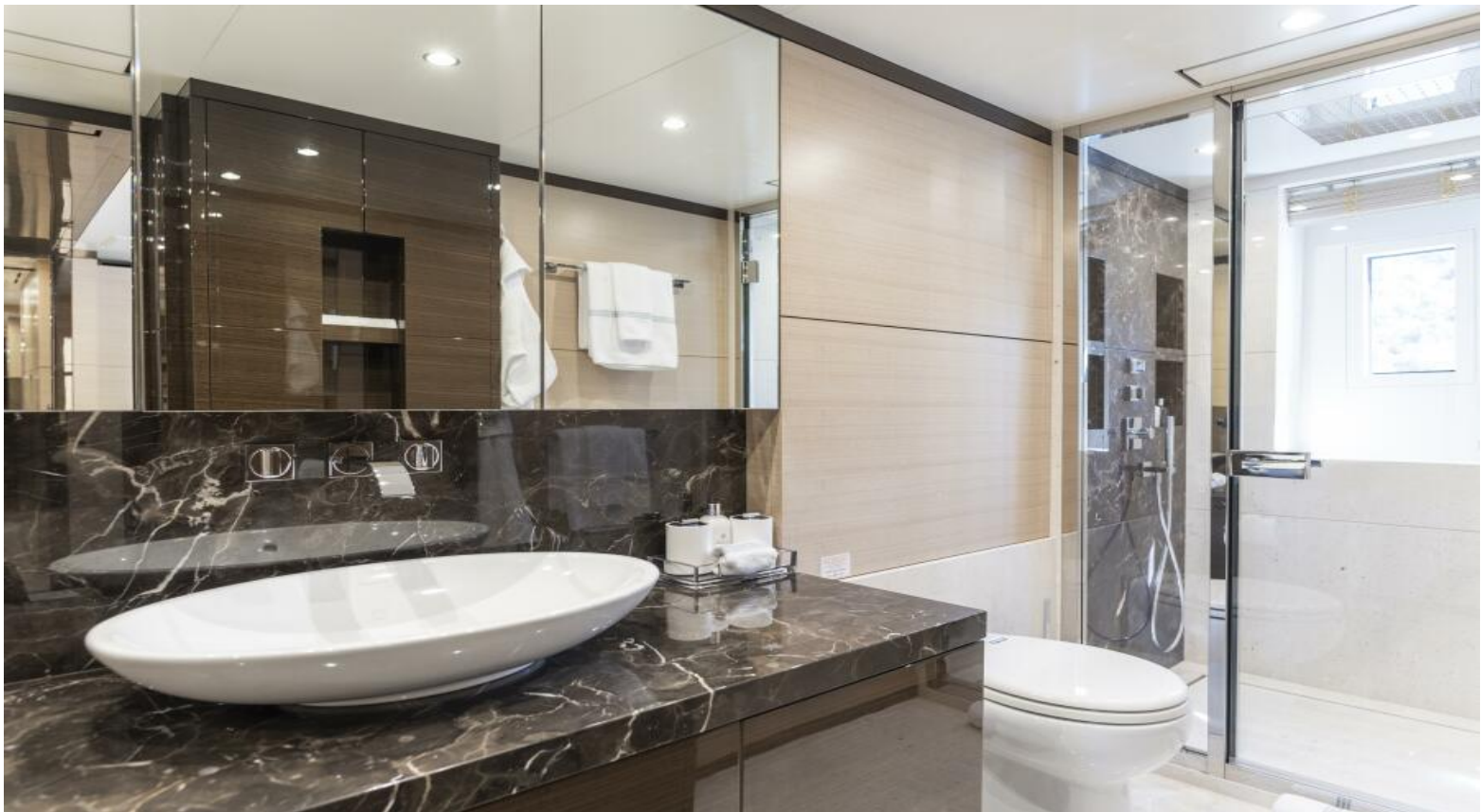
Queen Lower Deck VIP