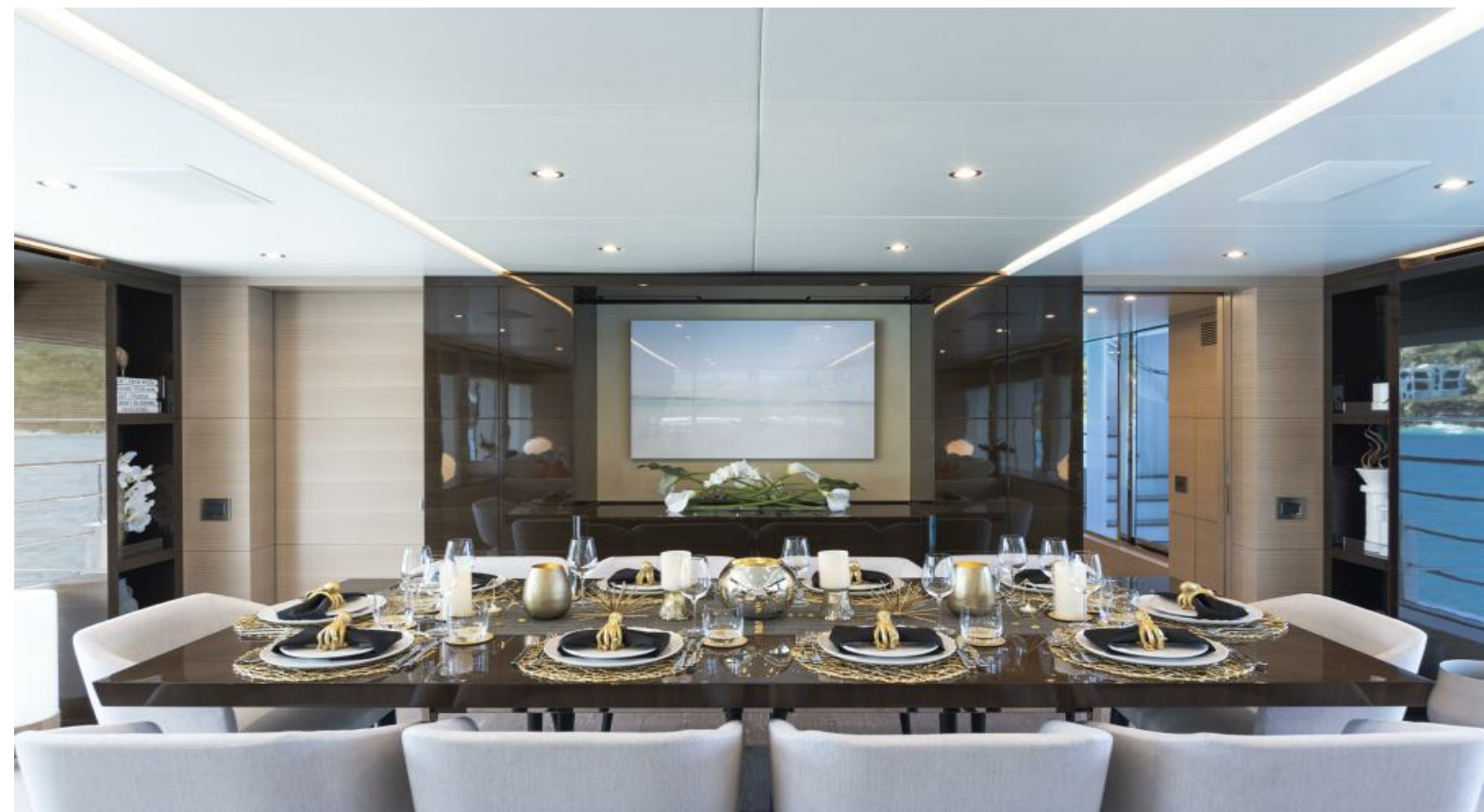
Dining and Salon