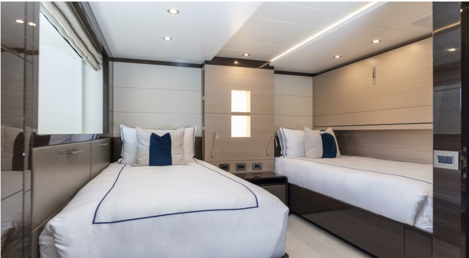
Lower Deck Twin Cabin With Pullman Berth