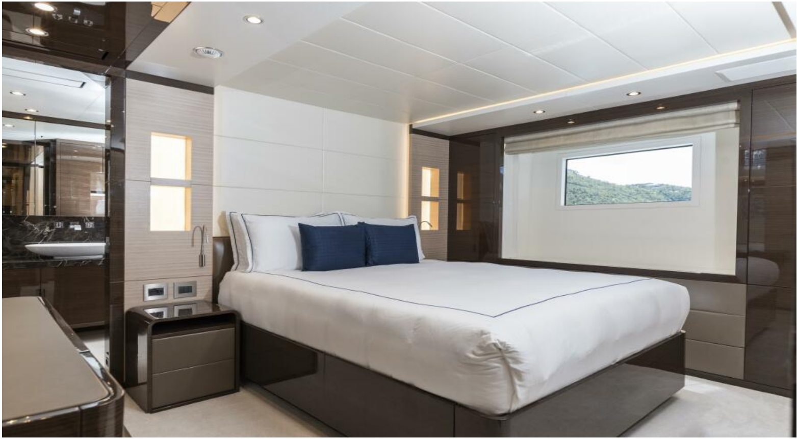
Queen Lower Deck VIP