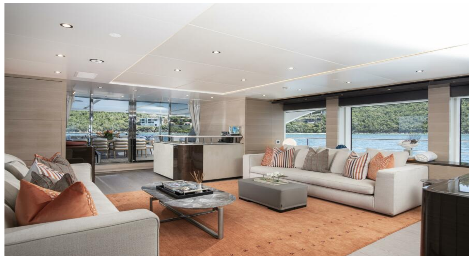
Salon Facing Starboard