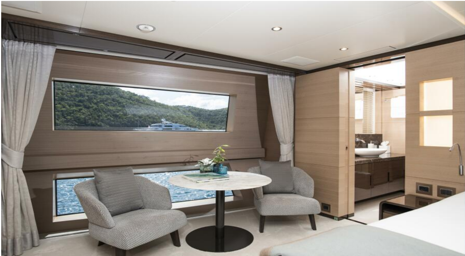
On Deck Owner Suite Forward