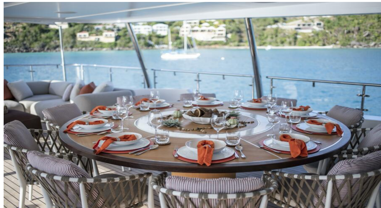
Under Cover Dining Table With Lazy Susan, Skylounge Deck Aft