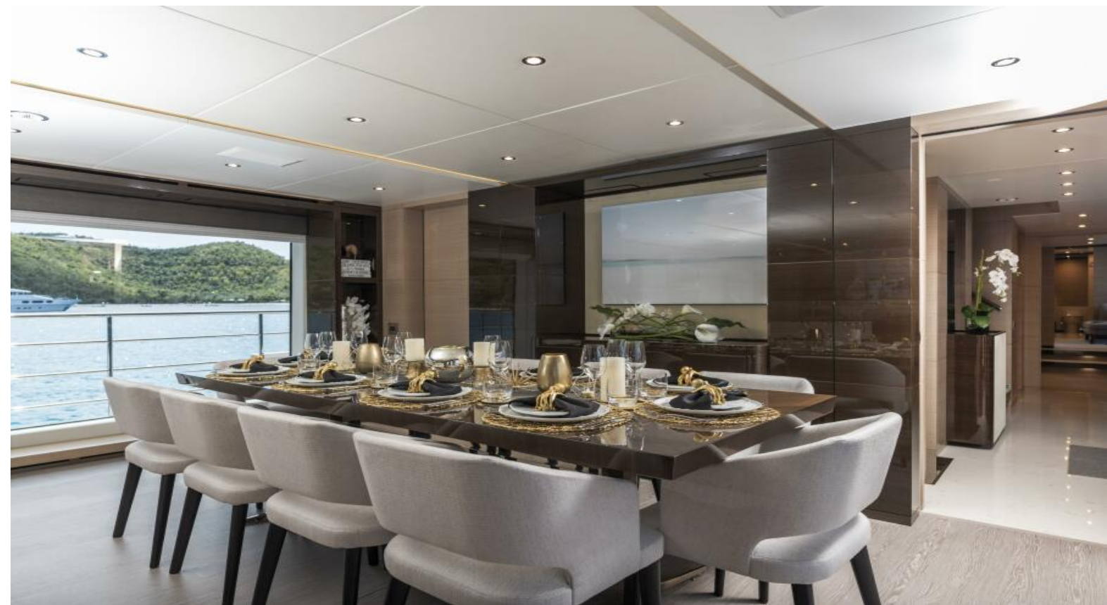
Dining and Salon