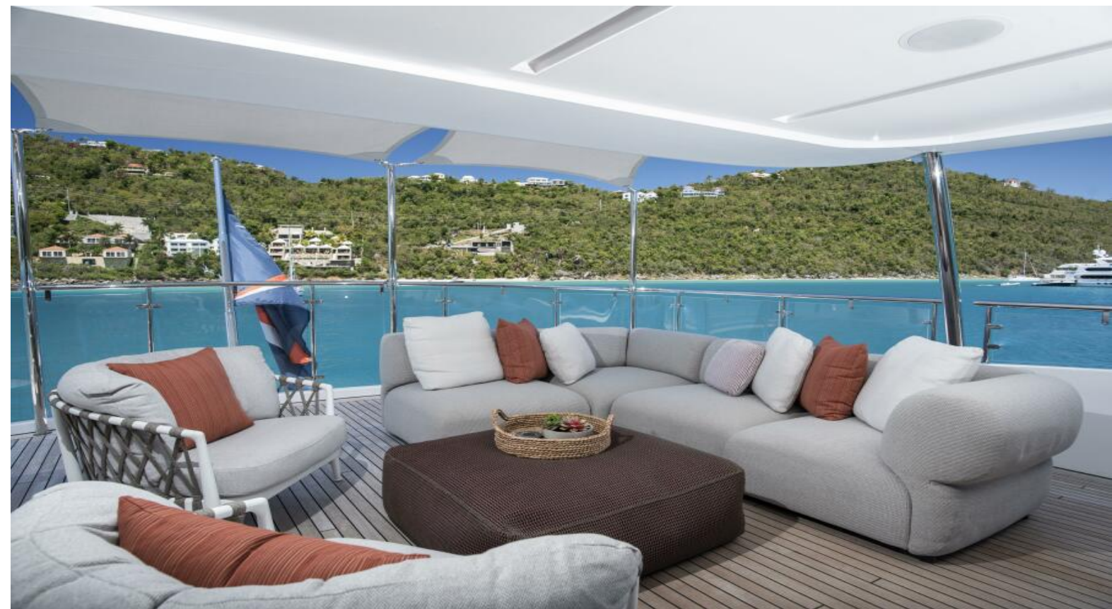
Lounging Area Aft of Dining, Skylounge Deck