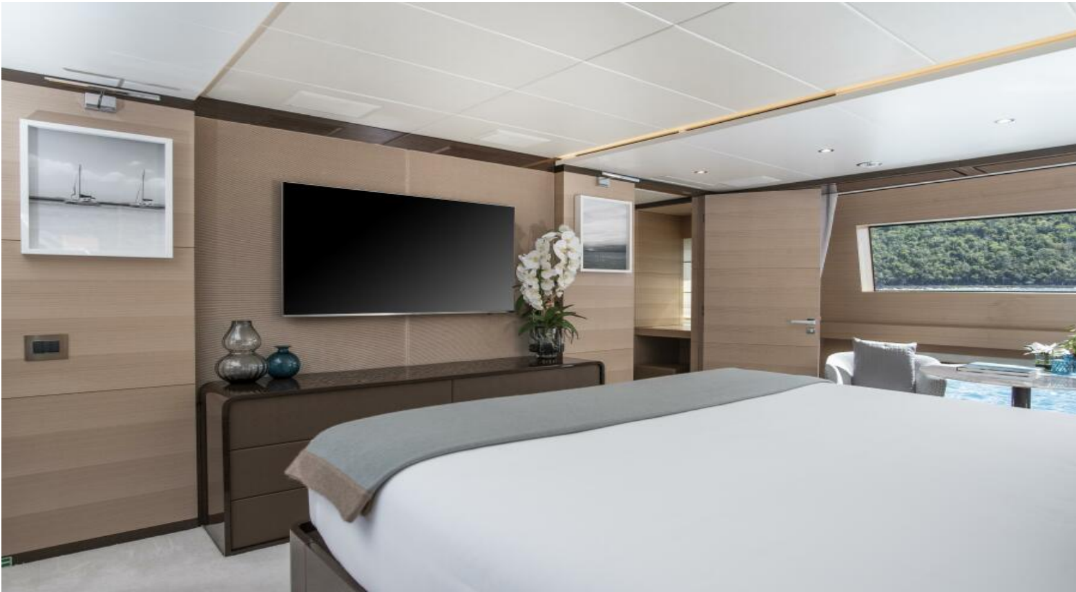
On Deck Owner Suite Forward