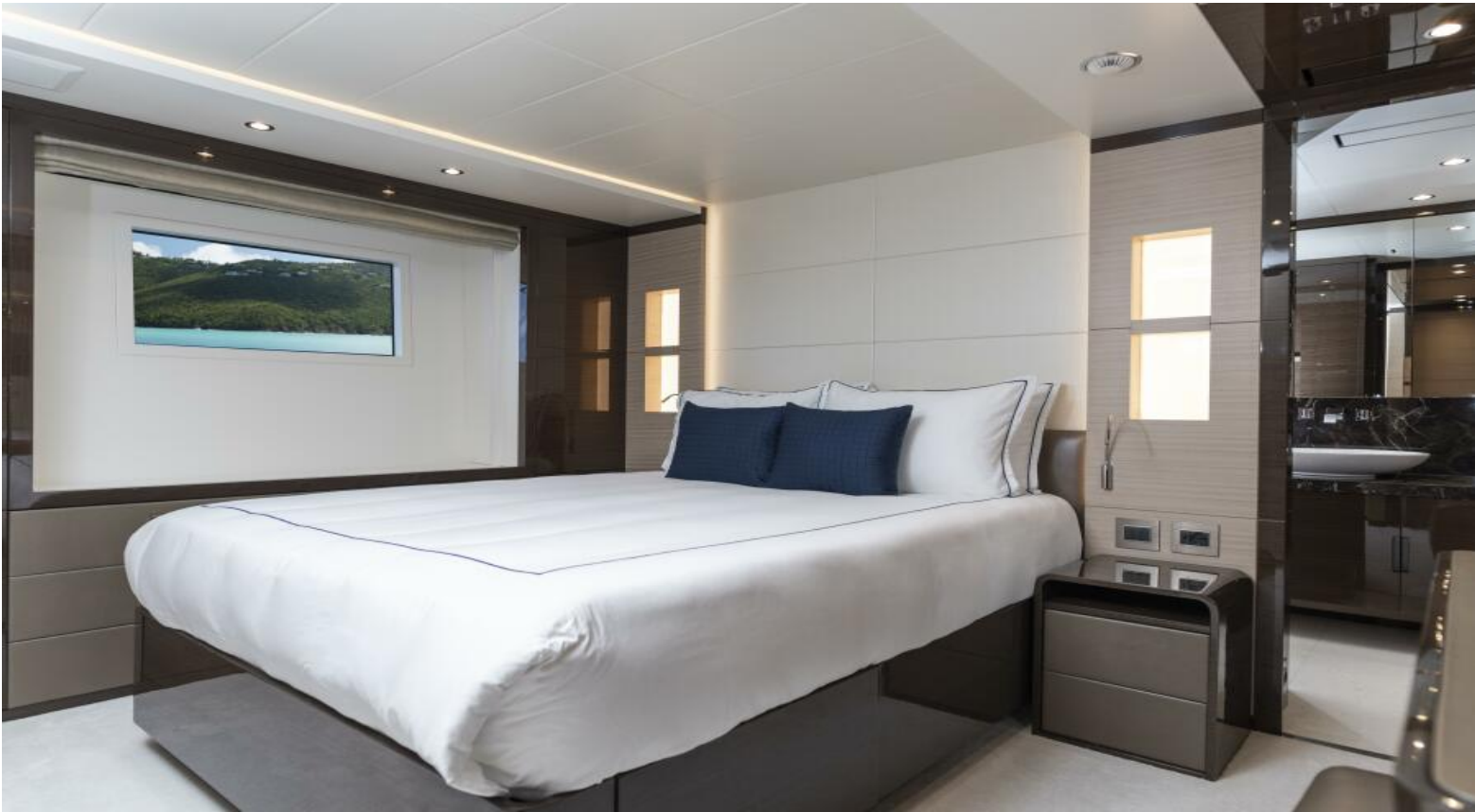
Queen Lower Deck VIP