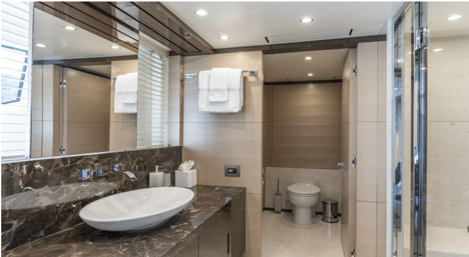
On Deck Owner Suite Forward