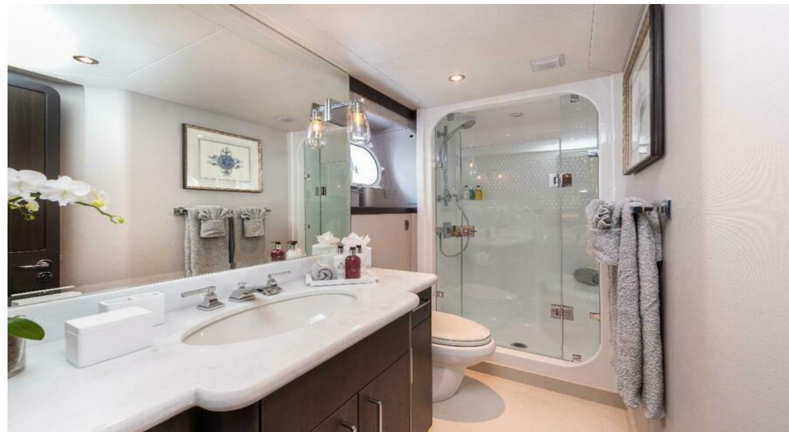
Starboard Guest Ensuite