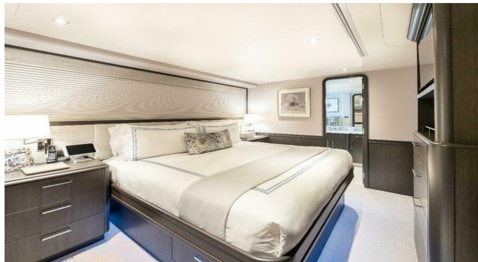
Port VIP Stateroom