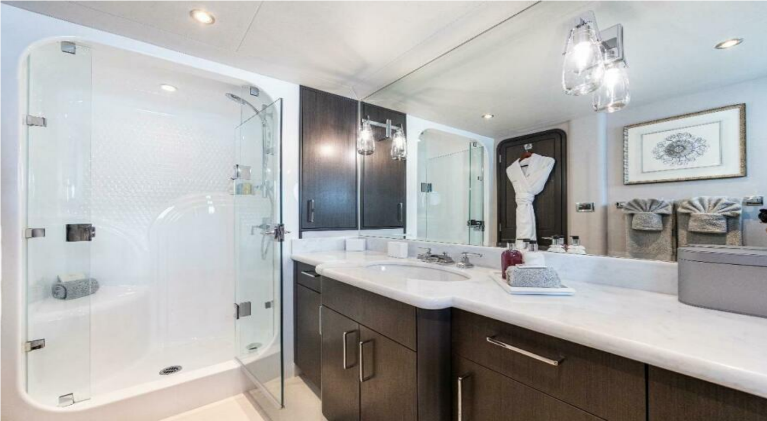
Starboard VIP Ensuite