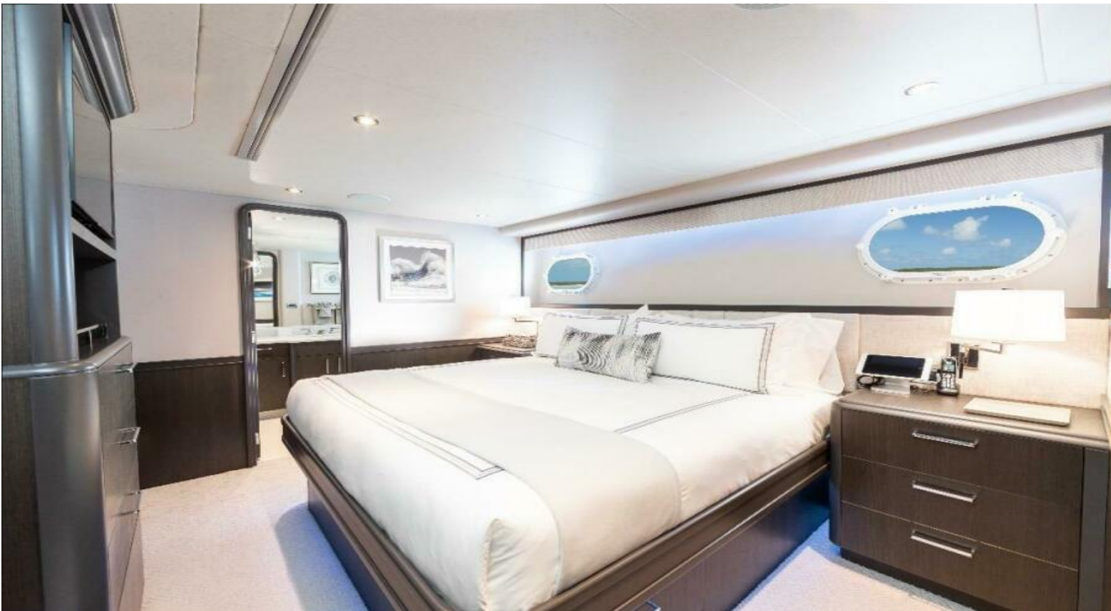
Starboard VIP Stateroom