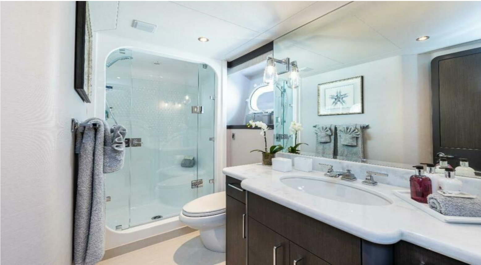
Port Guest Ensuite