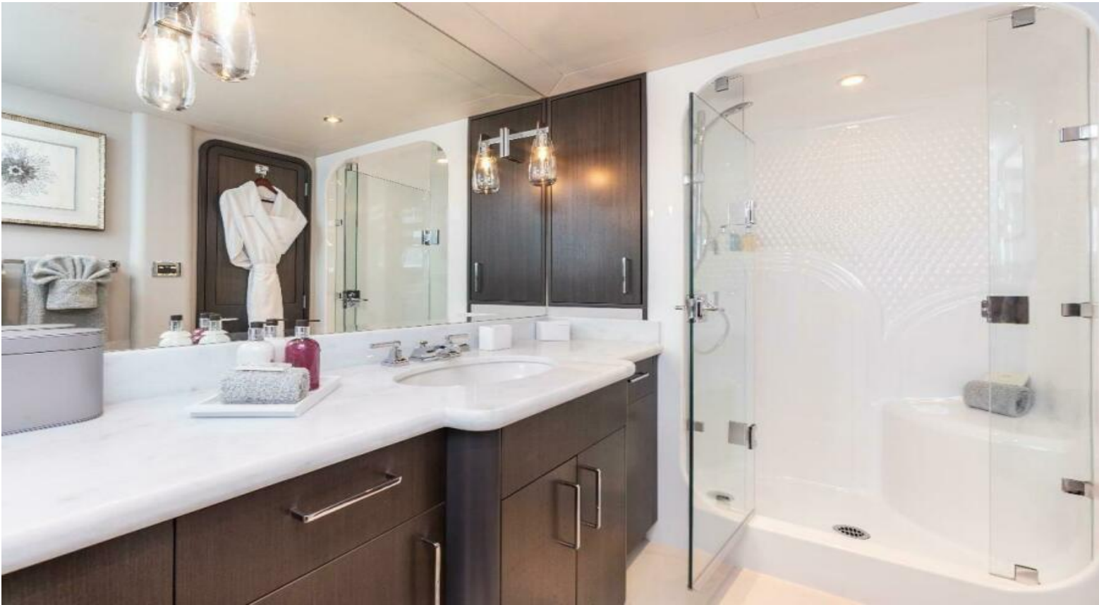
Port VIP Ensuite