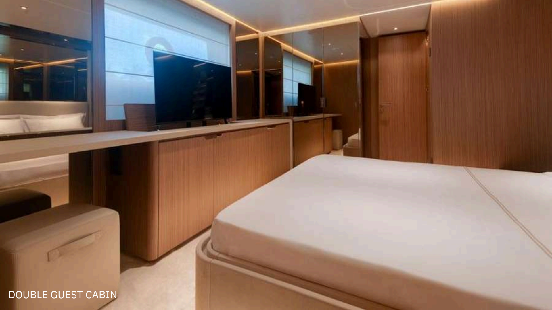
DOUBLE GUEST CABIN