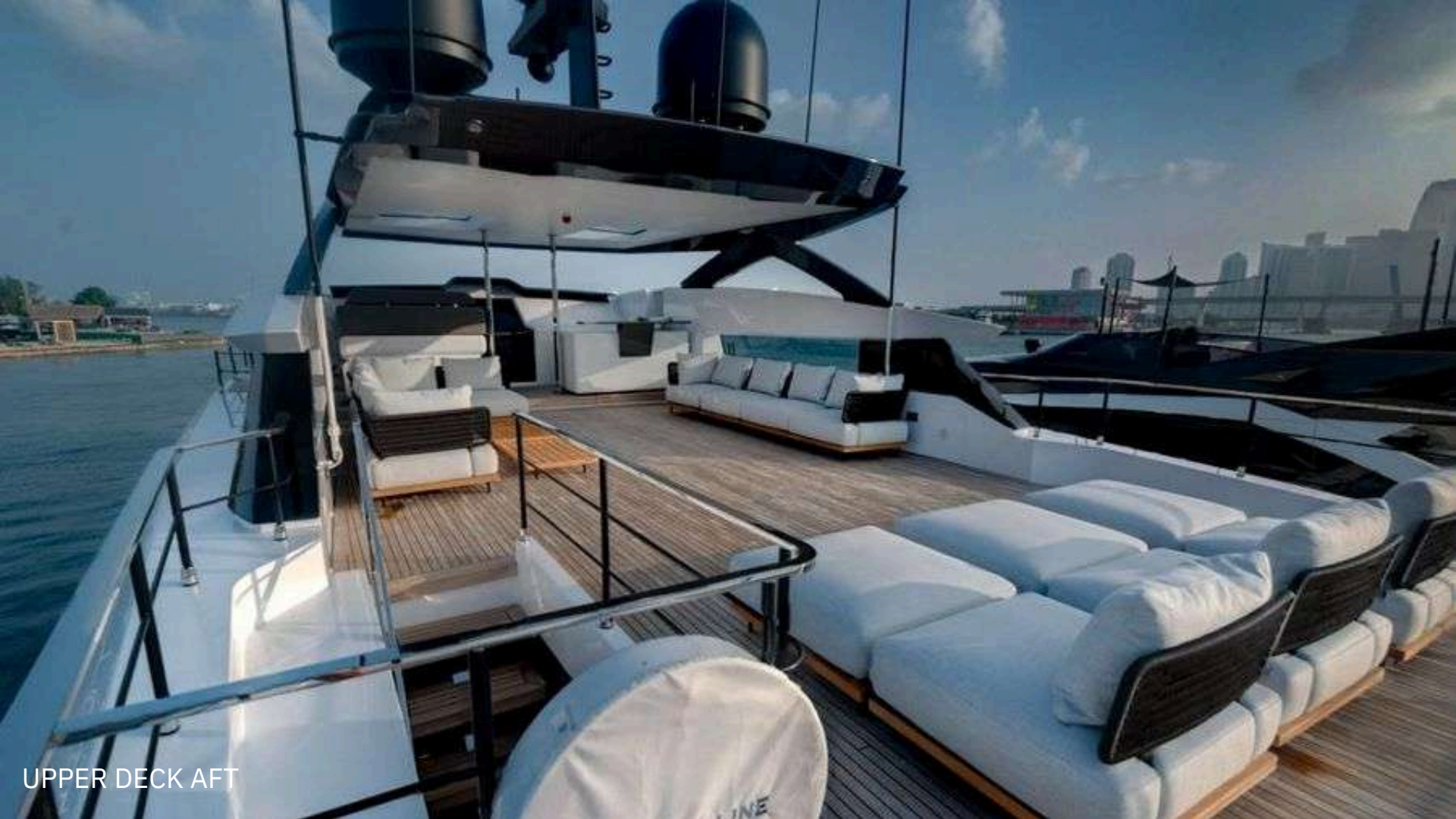
UPPER DECK AFT