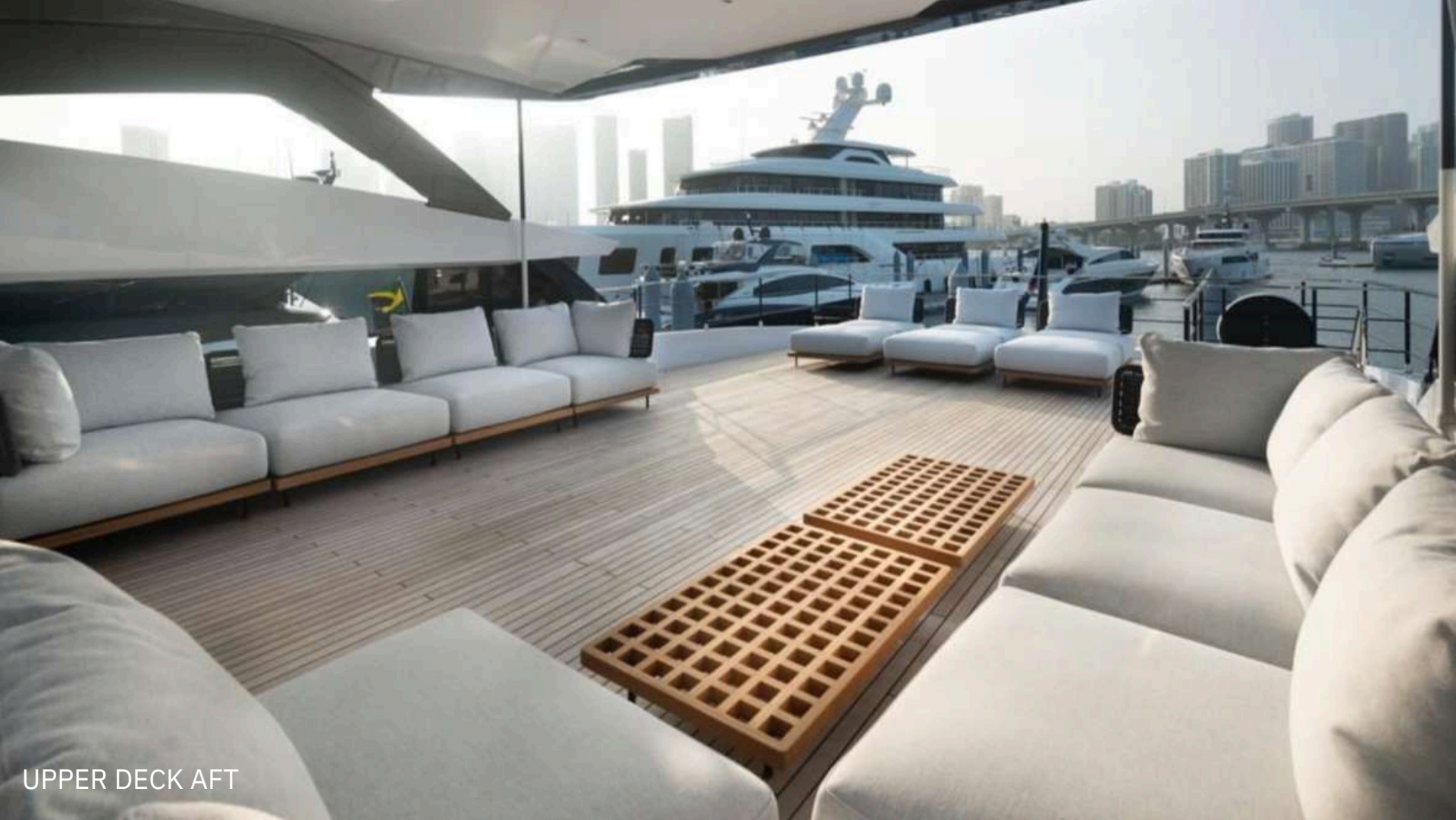
UPPER DECK AFT