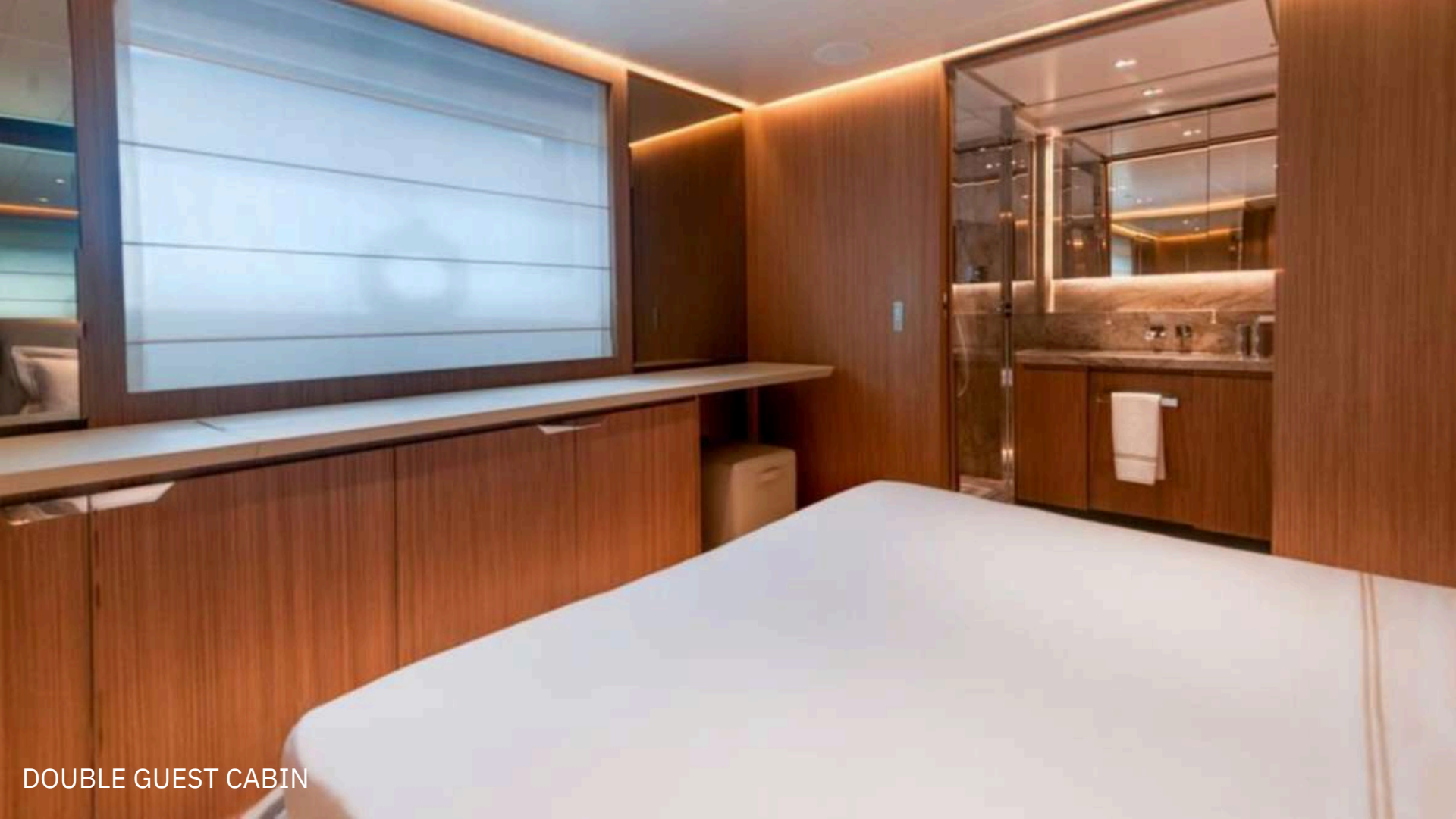
DOUBLE GUEST CABIN