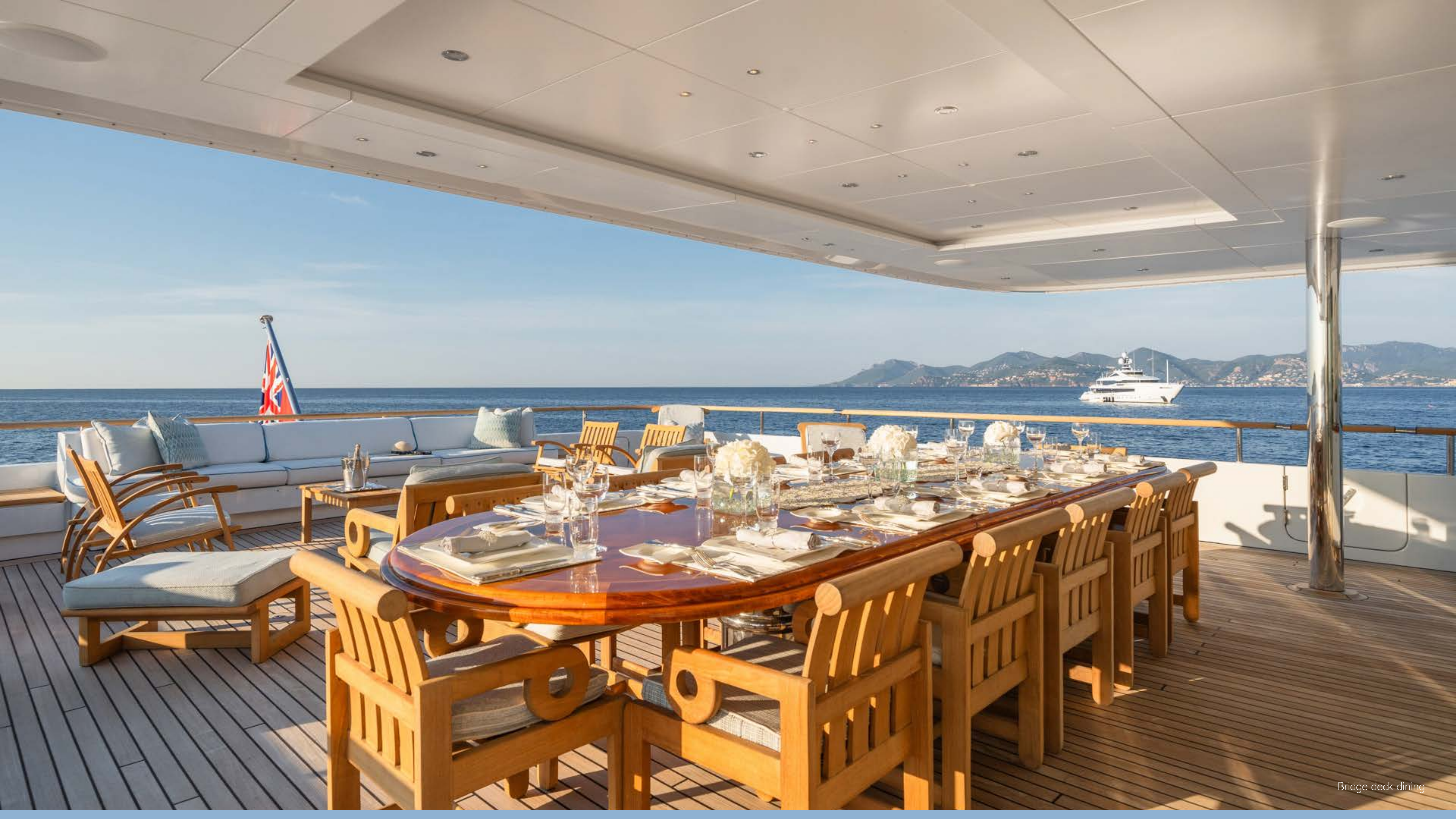
Bridge deck dining