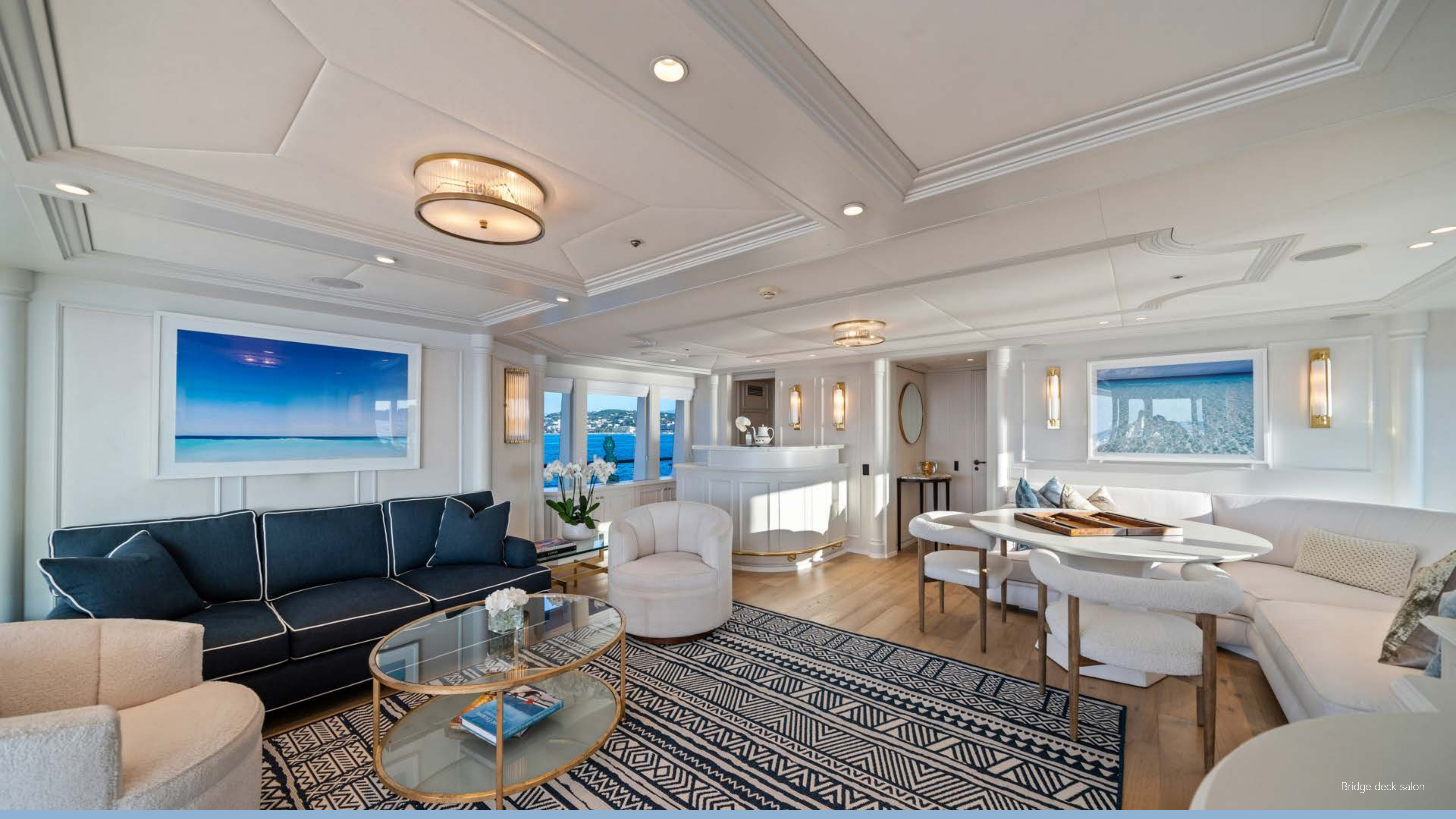
Bridge deck salon