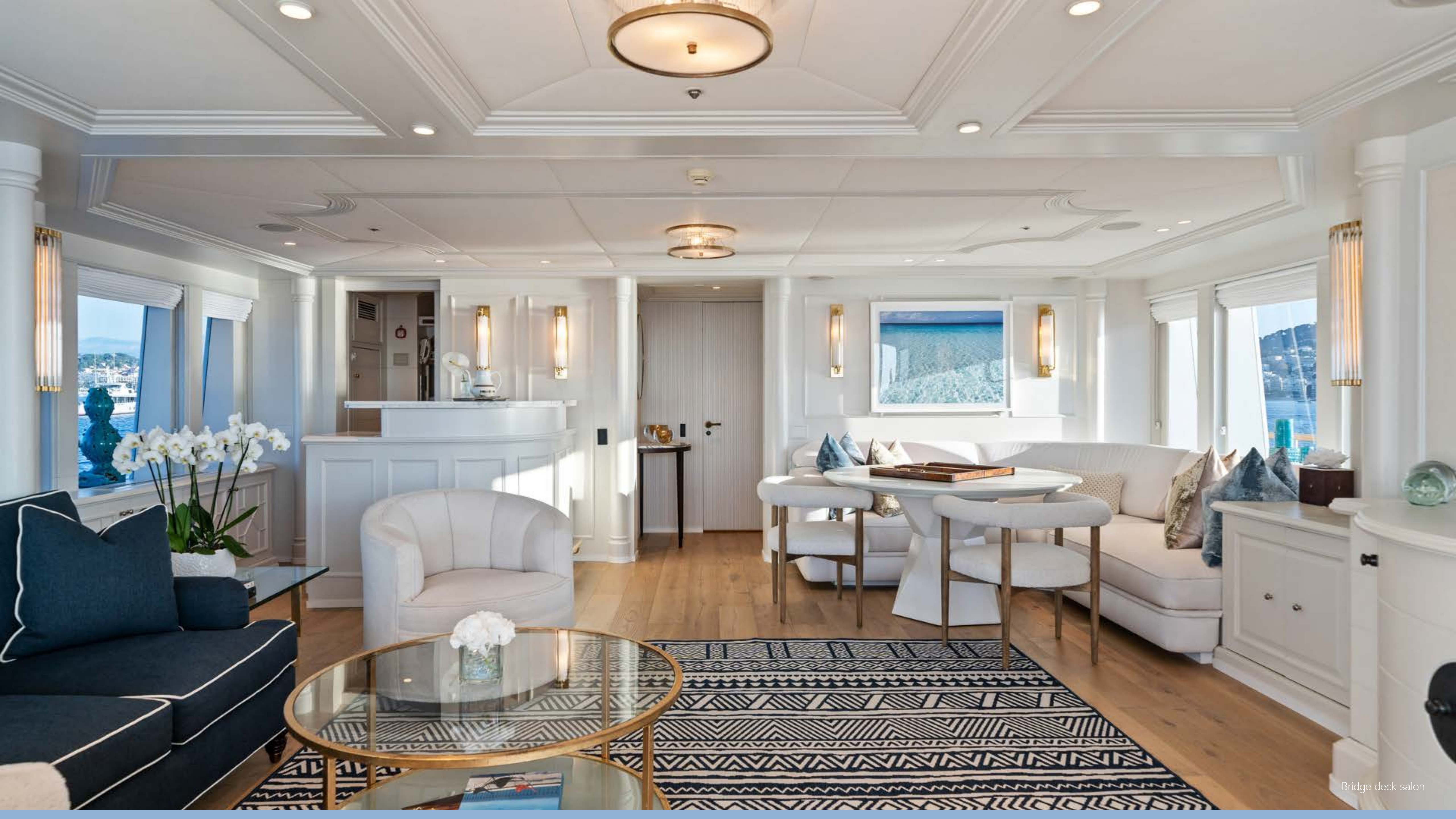
Bridge deck salon