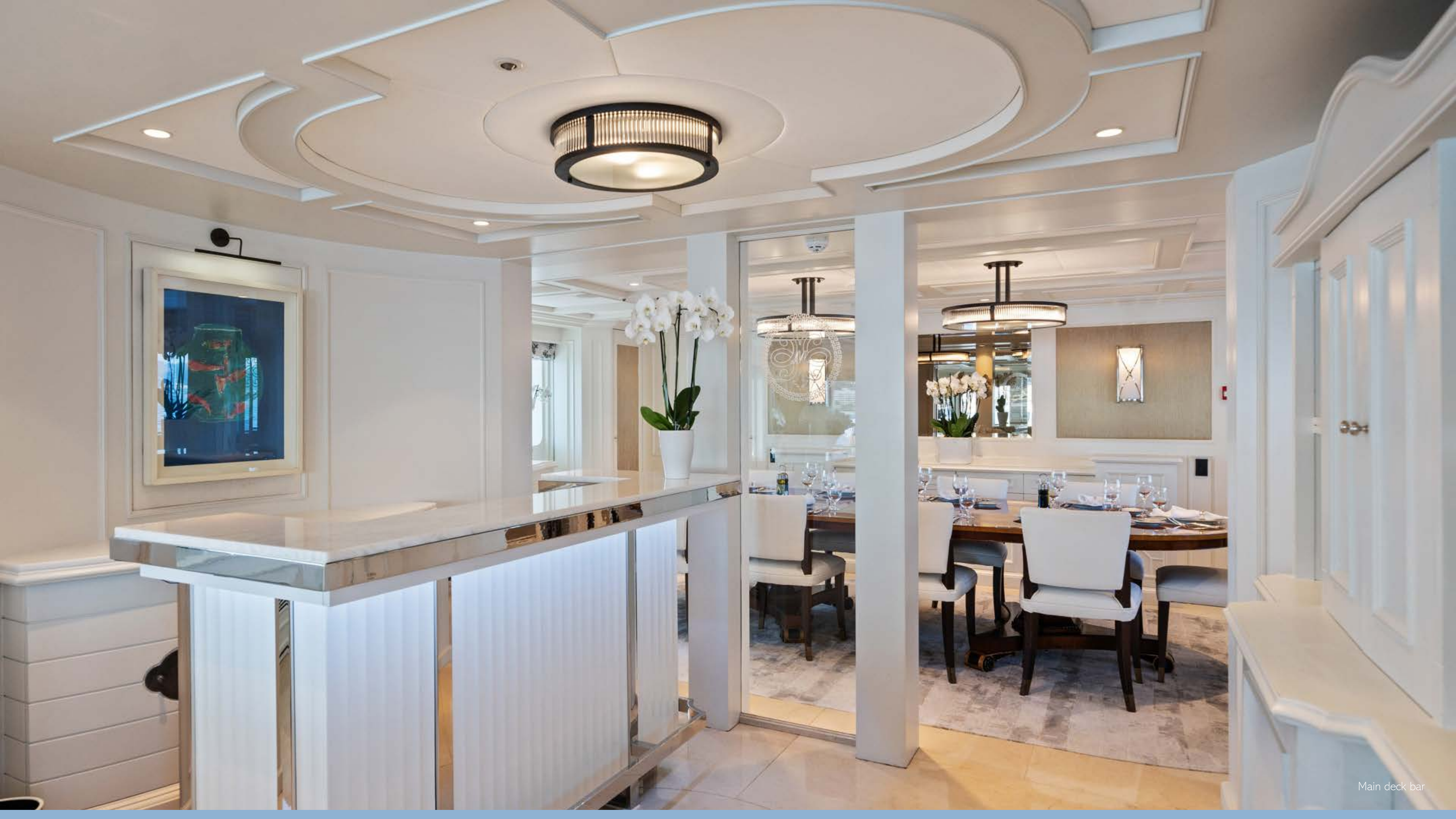
Main deck bar