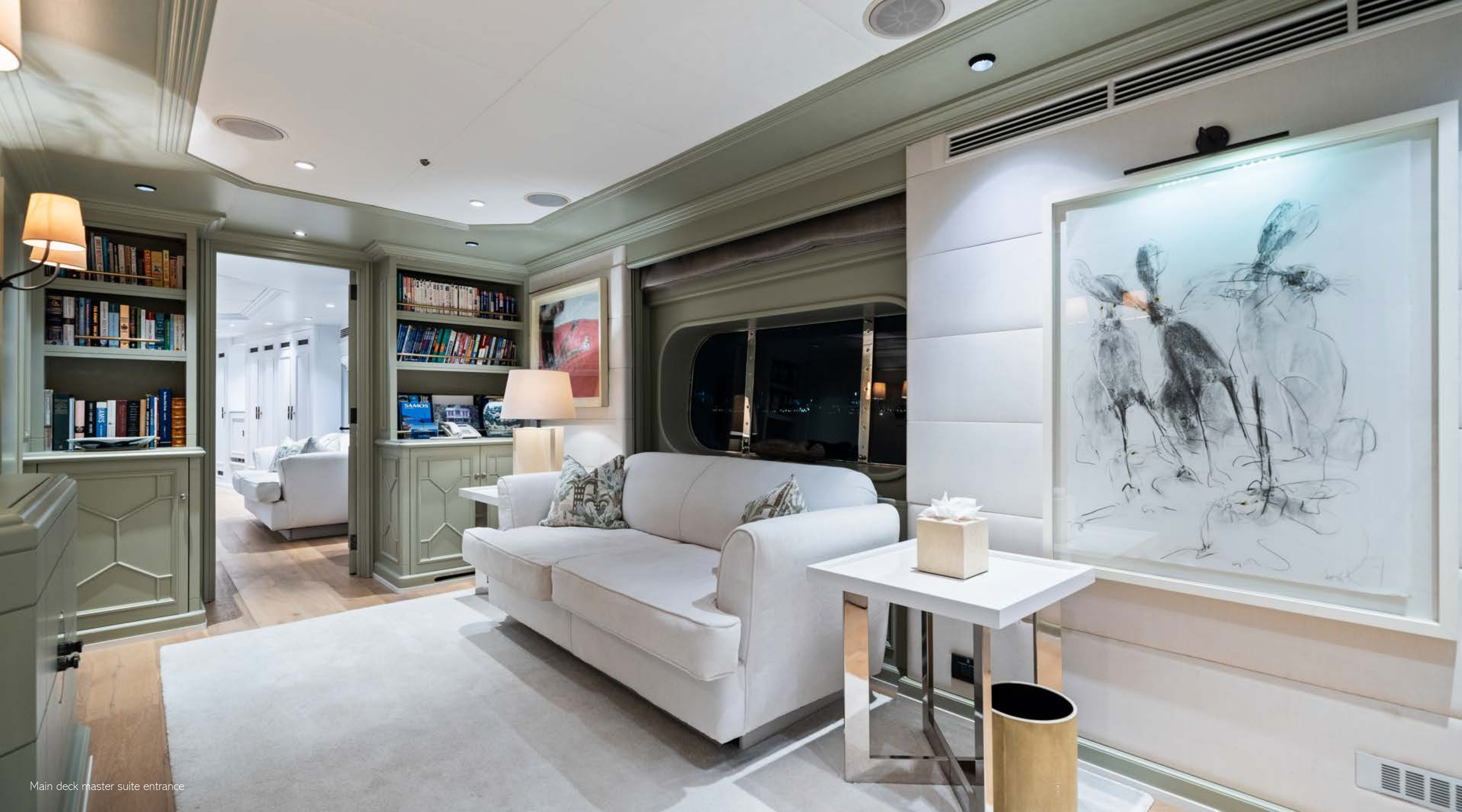
Main deck master suite entrance