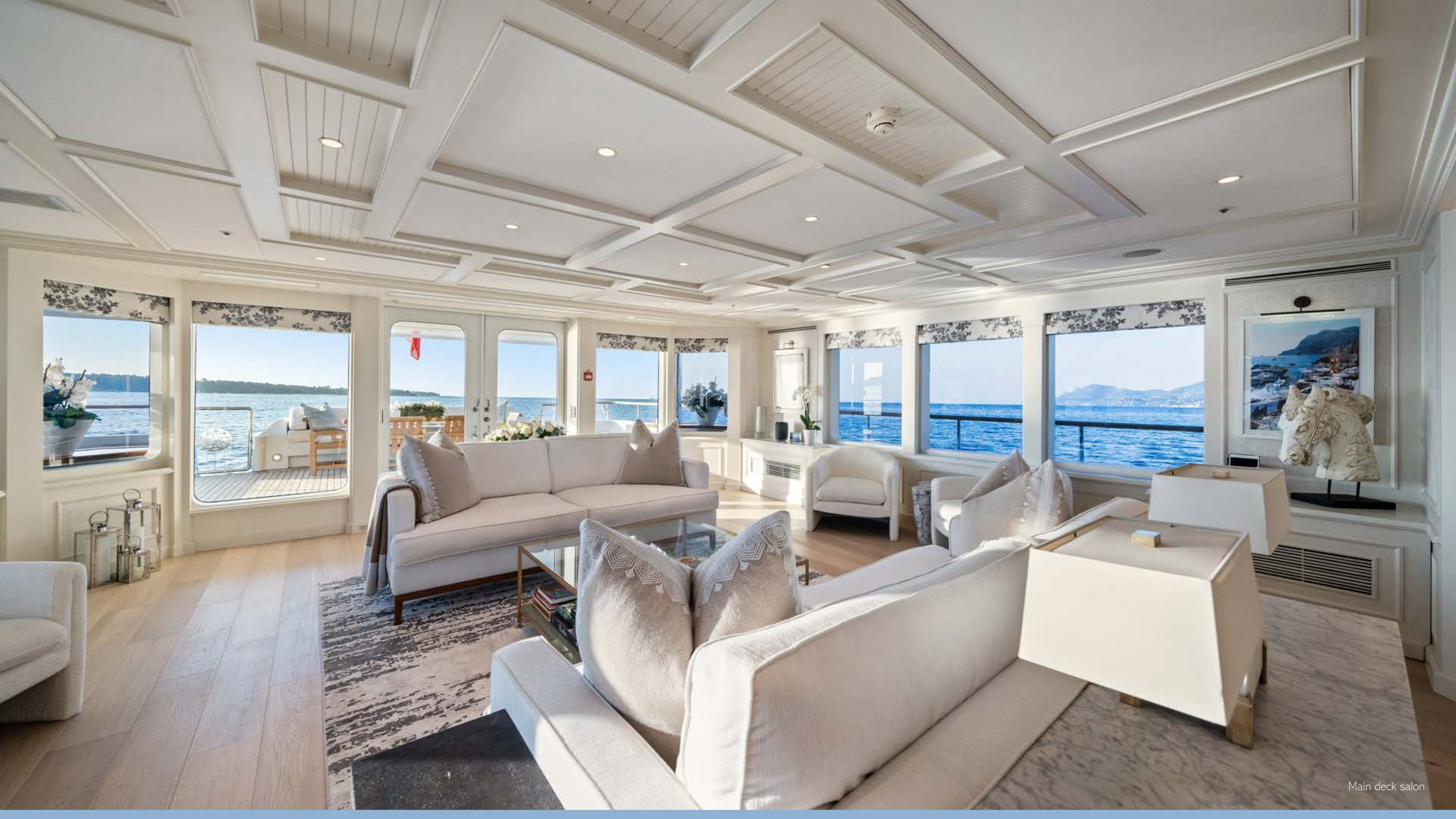
Main deck salon