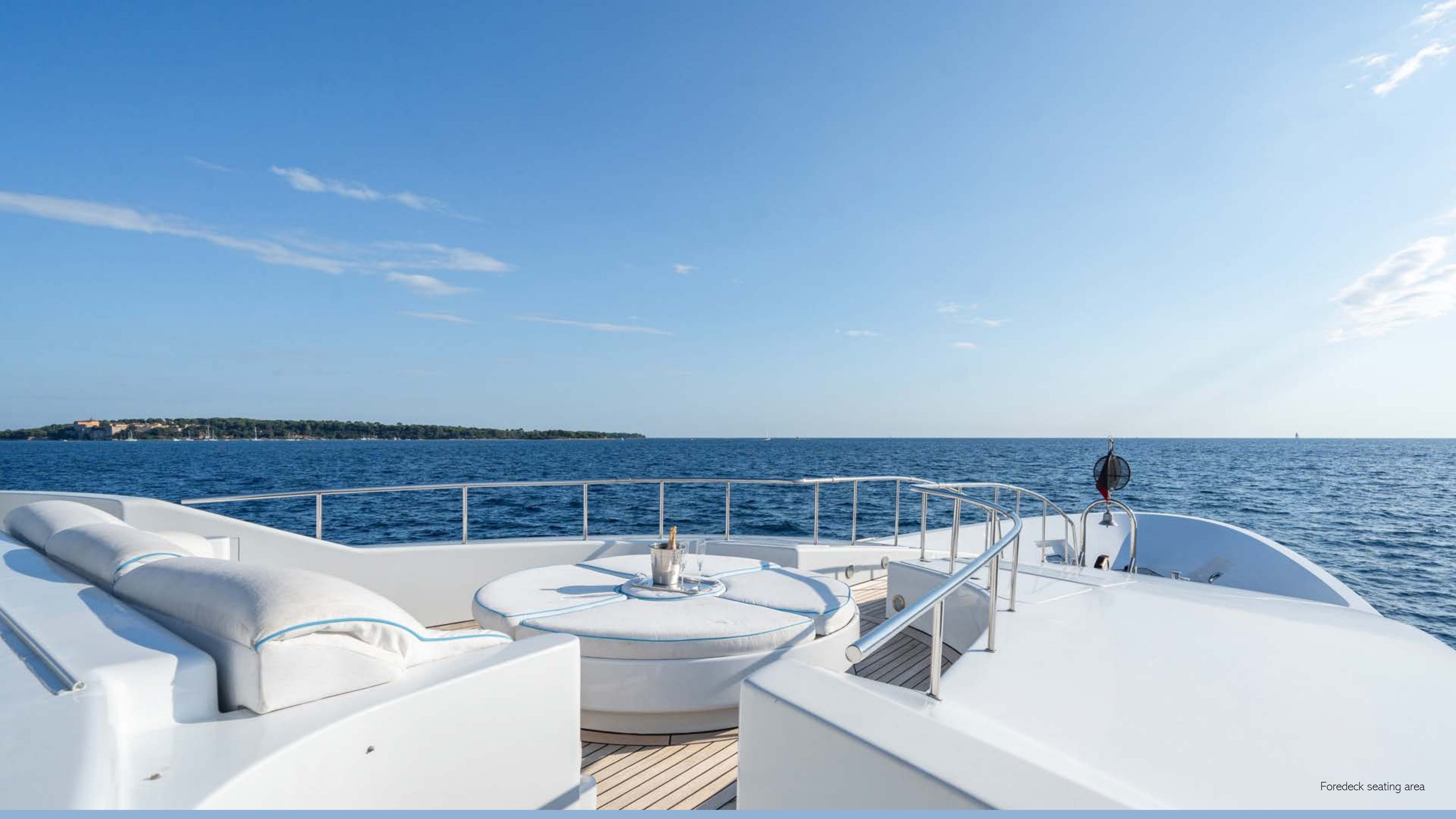
Foredeck seating area