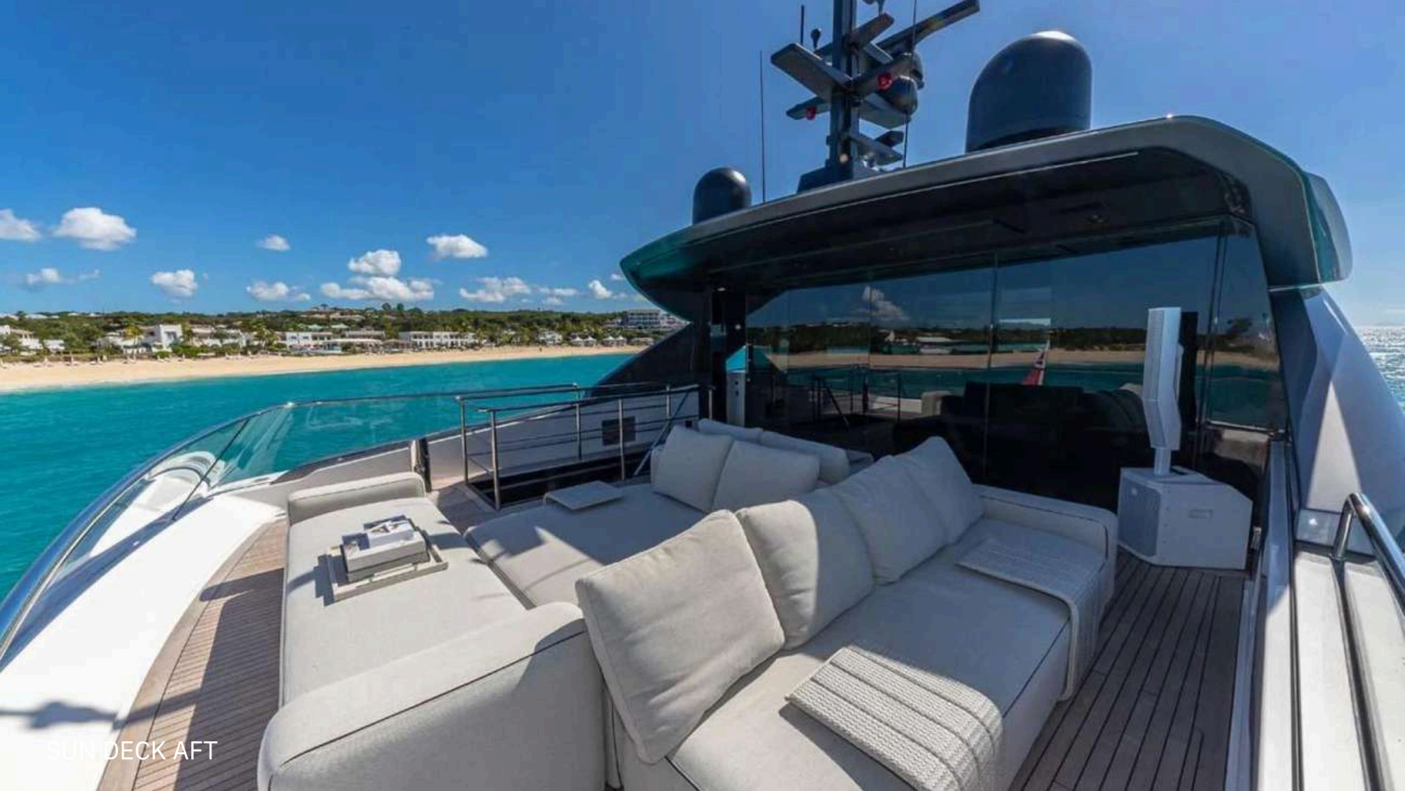
SUN DECK AFT