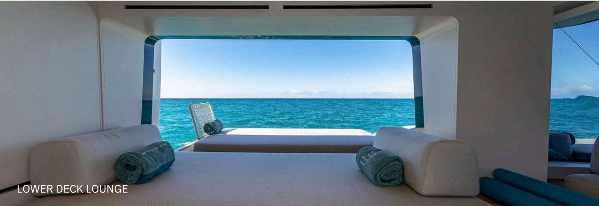
LOWER DECK LOUNGE

Inside, ANOTHERONE showcases seamless indoor-outdoor living: large sliding glass doors, full-height windows, and fold-out terraces merge the exterior deck spaces with the salon and interior lounges. The lower deck houses guest cabins and a lounge/gym area, ensuring that the social and private spaces are both elegant and functional. Materials, finishes and layout reflect the contemporary minimalist style associated with StudioLissoni, while the overall architecture by Zuccon gives the yacht a clean, fluid profile. The beach-club area at the stern is especially noteworthy, with fold-down terraces and a large swim platform that doubles as a lounge and access point for tenders and water toys.