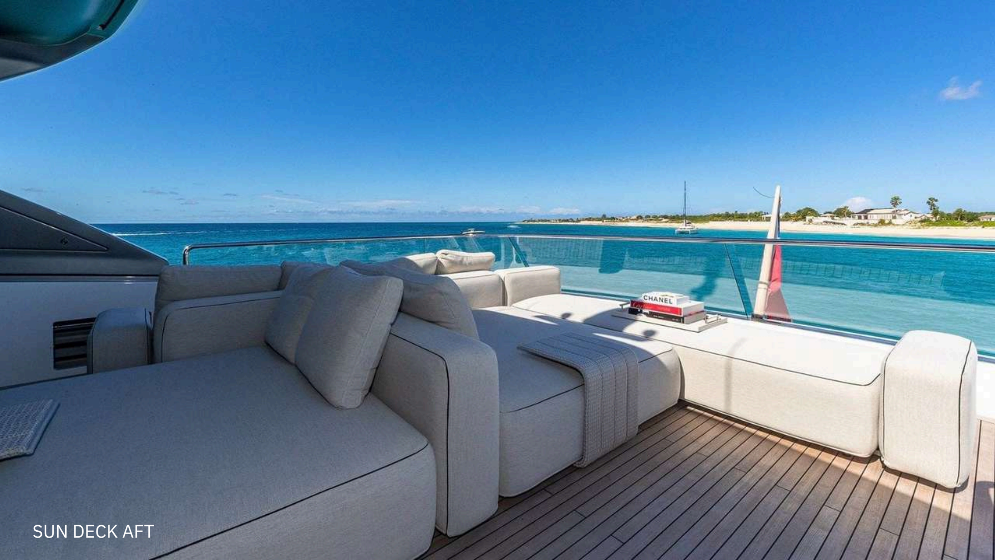
SUN DECK AFT