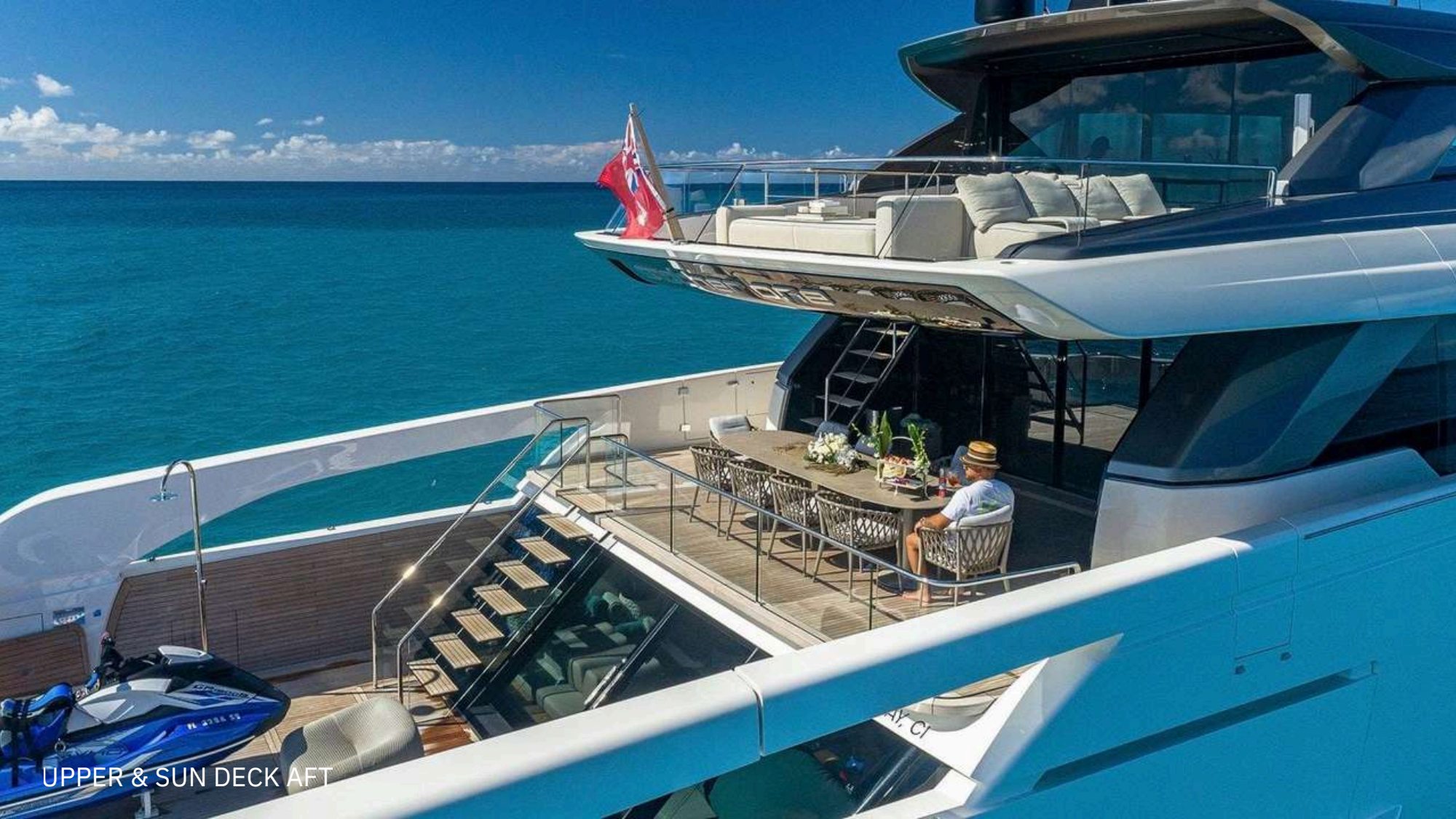
UPPER & SUN DECK AFT