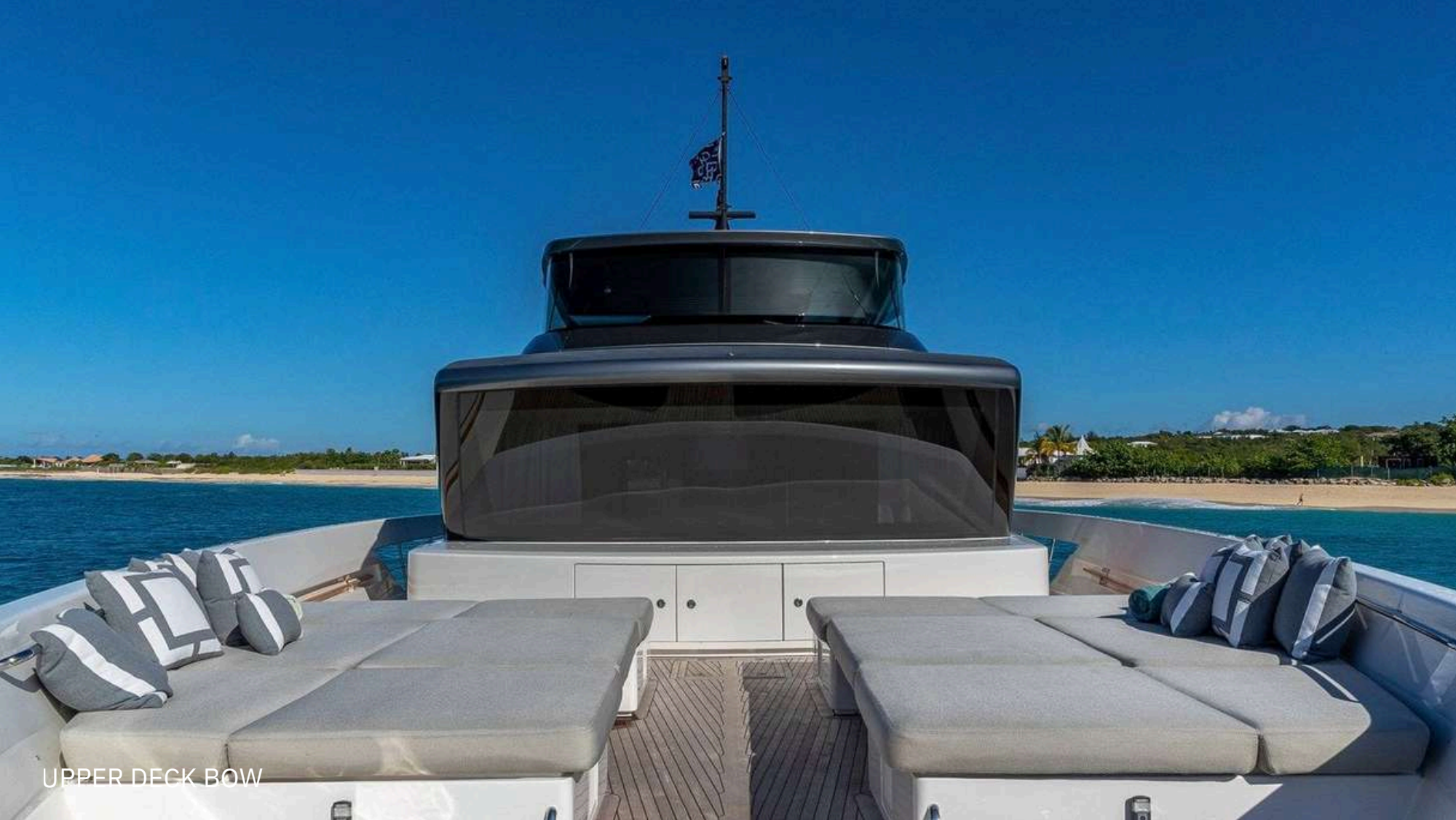
UPPER DECK BOW