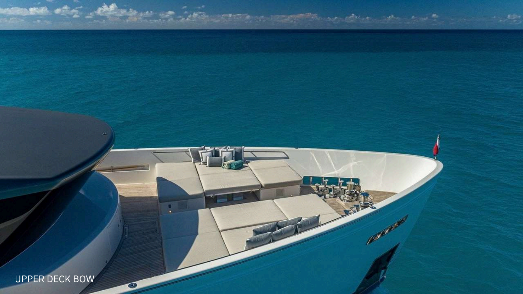
UPPER DECK BOW